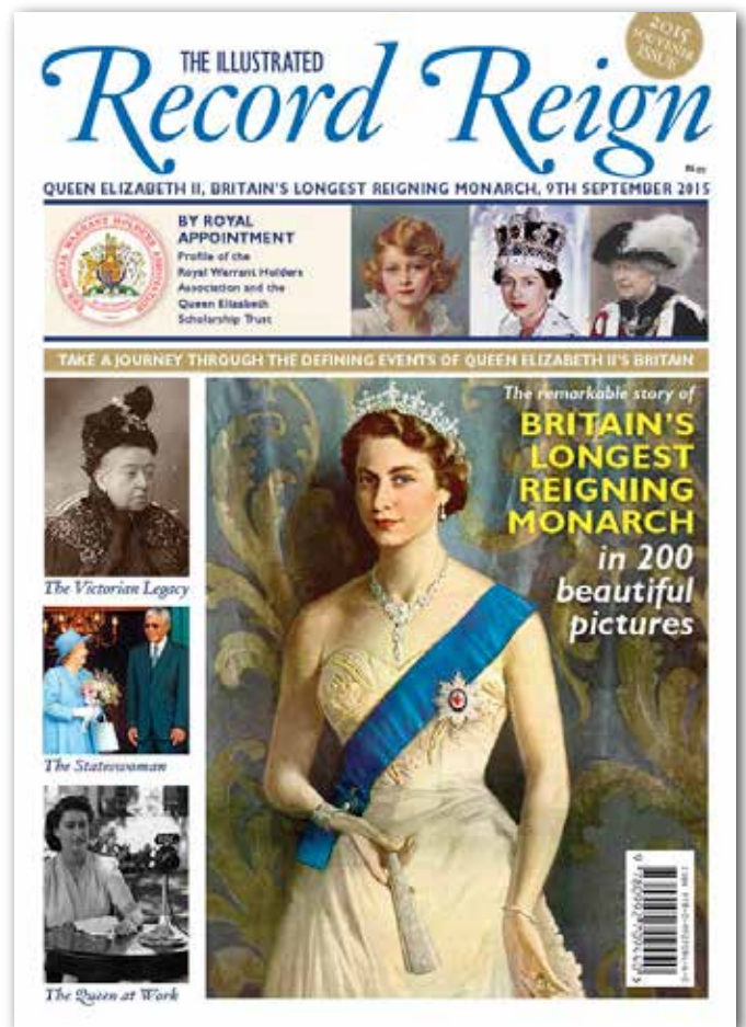
The Record Reign of Queen Elizabeth II