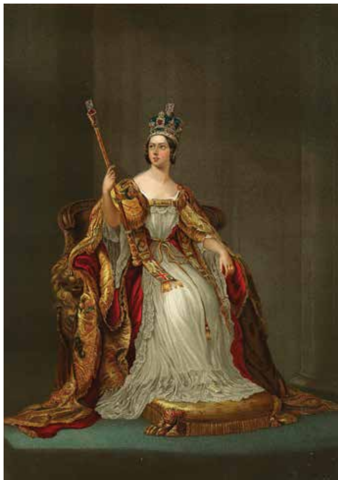
A Record Number of a Record Reign , illustration of Queen Victoria in 1837