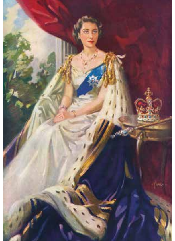
Portrait of H.M. Queen Elizabeth II by Terence Cuneo, painted for The Illustrated London News to celebrate the Queen's Coronation in 1953

Now in 2015, we are delighted to be collaborating with the Royal Warrant Holders Association and including a dedicated section "By Royal Appointment" in The Record Reign of Elizabeth II . It will celebrate her extraordinary time on the throne and remember the singular legacy of Queen Victoria. With thoughtful editorial and unseen archival images, it will reflect on how Britain and the monarchy have evolved under the reigns of two remarkable sovereigns.